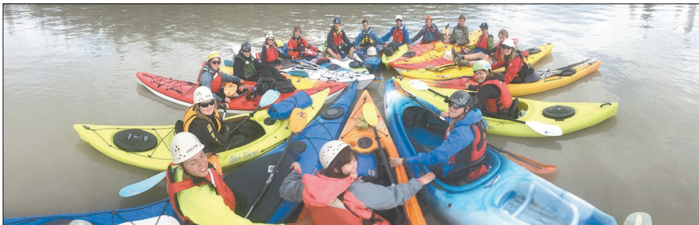
Just Liquid Sports offers paddlesports instruction and community paddle nights

Just Liquid grows water sports in the East Kootenay