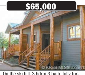
On the ski hill, 3 bdrm 3 bath, fully fur-ished share condo! Direct access to skiing right outside the building & golf course down the road! 13 weeks of the year or exchange option available. 2408181 Call Melanie Walsh