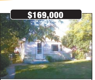
Conveniently located, 2 bdrm, 1 bath home is close to school transit and kitchen/dining with laminated flooring Call Melanie Walsh