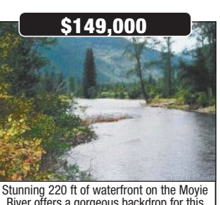
Stunning 220 ft of waterfront on the Moyie River offers a gorgeous backdrop for this incredible property. This level 4.23 acre lot boasts privacy and an abundance of ildlife, 2402798