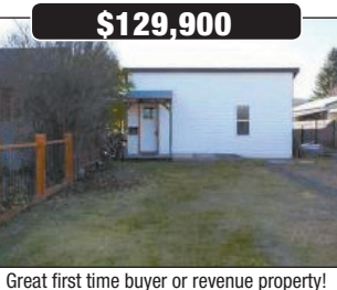
Home has newer windows, roof, appli ances, space heater. Spacious rooms throughout. The lot is nice and level.