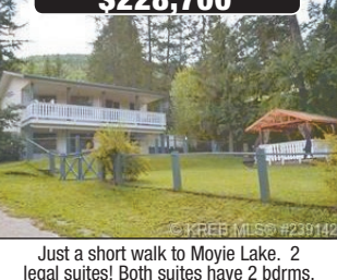
legal suites! Both suites have 2 bdrms kitchen, living space, bath, laundry. Fenced yard, garden space, picnic, fire pit area. 2409015 Call Melanie Walsh