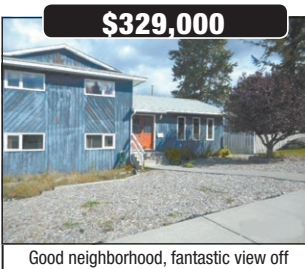
the back deck. This is a home that needs a family's tender loving care. New paint inside, newer roof and hot water tank in 2013 Come take a look 2408284 Call Crystal or Sharron