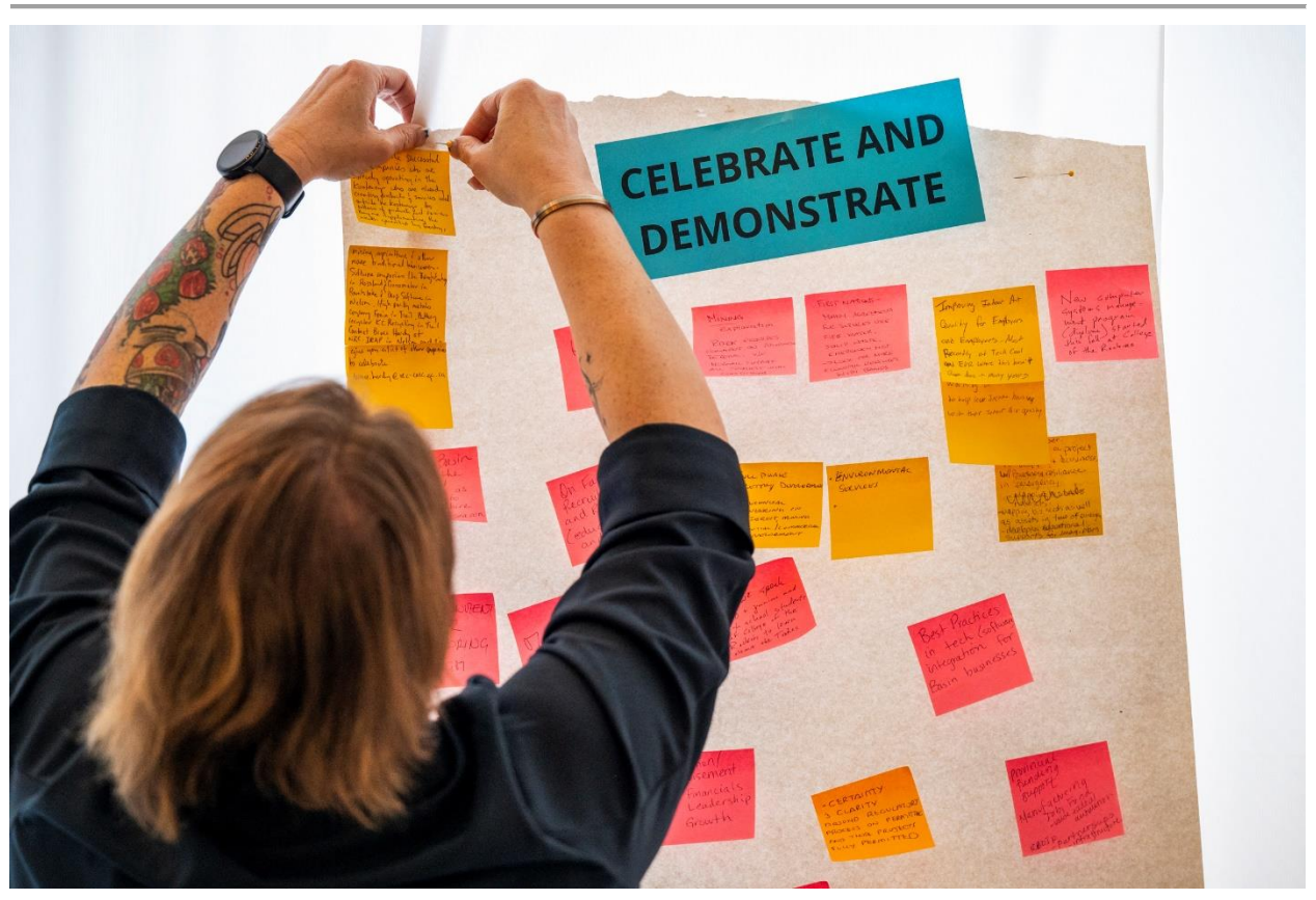
A series of workshops provided a forum for attendees to share their successes and contributions to the region

A recurring theme during the Summit was the need to elevate the awareness of some of the achievements of business and industry in the region, and to spread that message proudly.