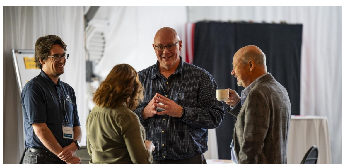
Community Partners, Chambers of Commerce, and elected officials connect with each other