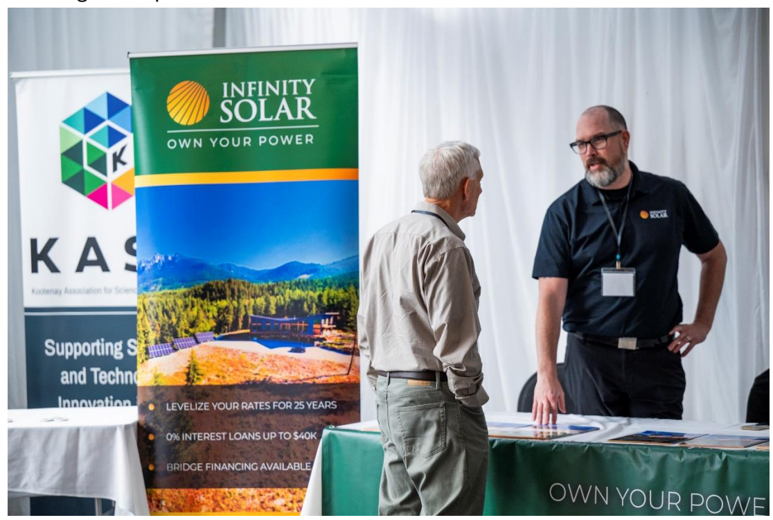
Networking opportunities for numerous industries and sectors

The Kootenays is considered one of the best places in Canada for renewable energy harvesting, yet significant infrastructure gaps are preventing the region from fully realizing its full potential.