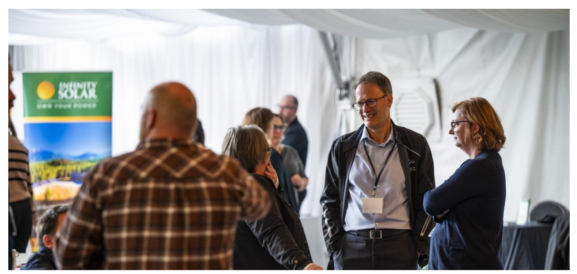
Attendees discuss ideas for partnerships in Industry, Education & Technology

Throughout the duration of this initiative, it became evident that simply bringing together stakeholders from across the region to discuss forestry-related issues had a significant positive impact. The discussions highlighted the interconnectedness of the forestry sector with other industries and demonstrated how adapting to changes in one area often led to new opportunities in others, such as manufacturing and technology. A regional summit focused on the resource industry served as a logical next step to continue and expand these conversations. This summit would serve as a forum for addressing cross-sectoral challenges, exploring new opportunities, and fostering collaboration across industries, aiming to create a more resilient and diversified regional economy.